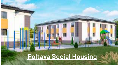
Poltava Social Housing