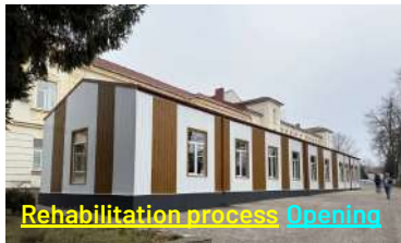
Rehabilitation process Opening