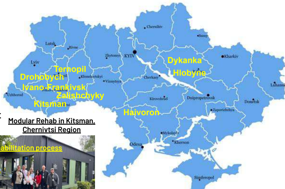
Modular Rehab in Kitsman, Chernivtsi Region

**Click the project description to view - all details in the link