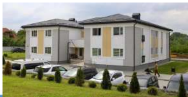
The AHLF Social Apartment Building, Drohobych-3, Lviv