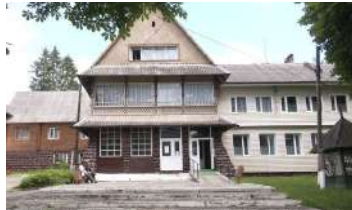
Modular Rehabilitation Center in Verkhovyna Hospital