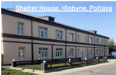
Shelter House, Hlobyne, Poltava