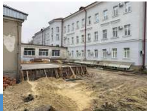
Ternopil Recovery Center