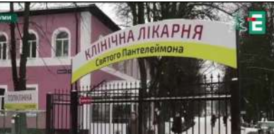
Sumy Rehabilitation Center