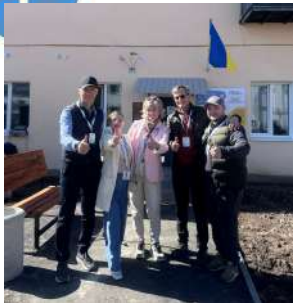
The Norwegian Social Apartment Building, Drohobych-1, Lviv