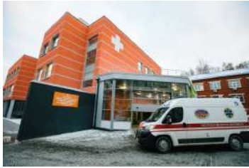
Vinnitsia Rehabilitation Center