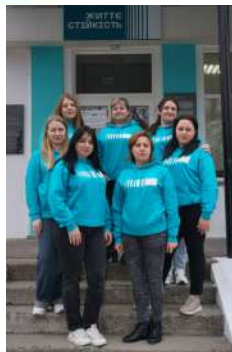
Haivoron, Kirovohrad Region, Resilience Center

**Click the project description to view - all details in the link