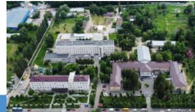
Boyarka Rehabilitation Center